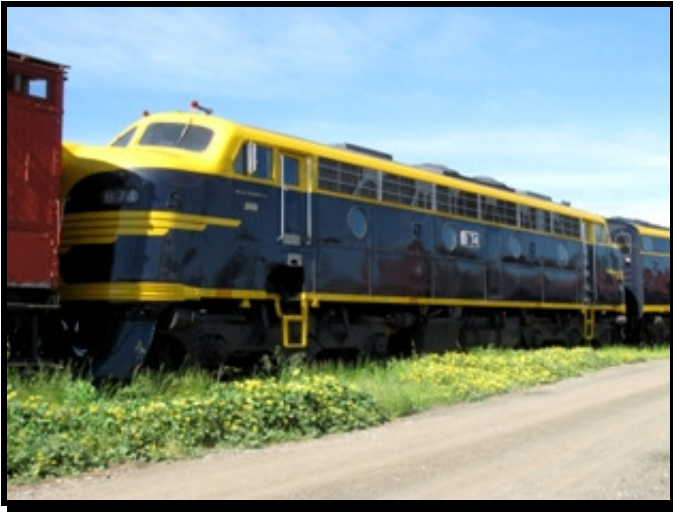
ML2 B class