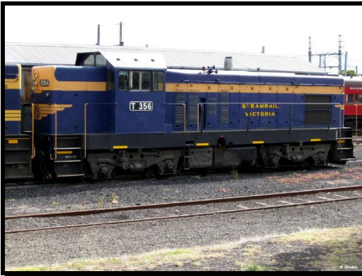
G8B T class