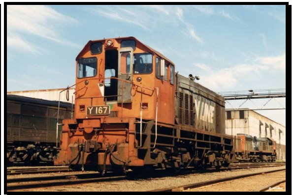
G6B Y class