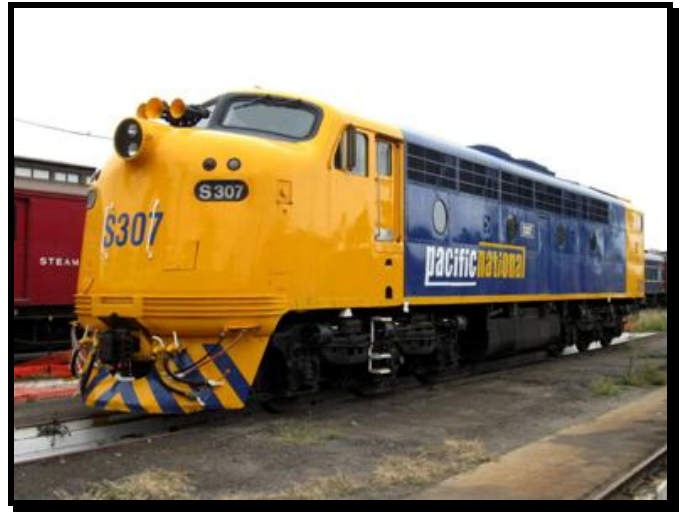
A16C S class